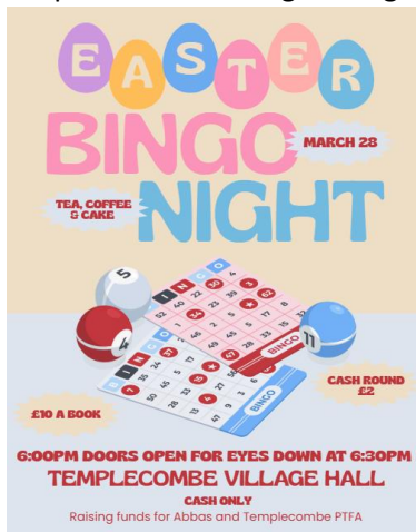
Easter Bingo Night on Saturday 28 th March.

Don't forget to support our Easter Bingo tomorrow night at the Village Hall – doors open at 6pm, eyes down at 6.30pm. It promises to be a great night.