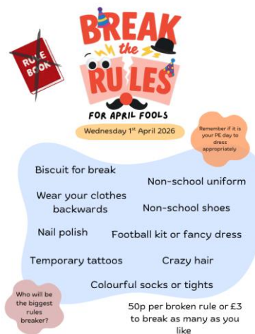
“Break the Rules for April Fools” followed by Movie ‘n’ Munch